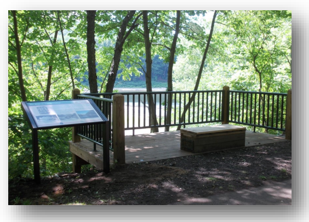
Providing public access and education

Promote good land use and public access through the protection, conservation and management of the open-space, forested, agricultural, historic, natural, ecologically significant, environmentally sensitive, biologically diverse and scenic resources of the Allegheny River and French Creek watersheds in northwestern Pennsylvania.