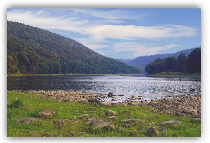
Protecting important watershed habitat

conservation easement has been negotiated, it is permanent and stays with the land even if it is sold.